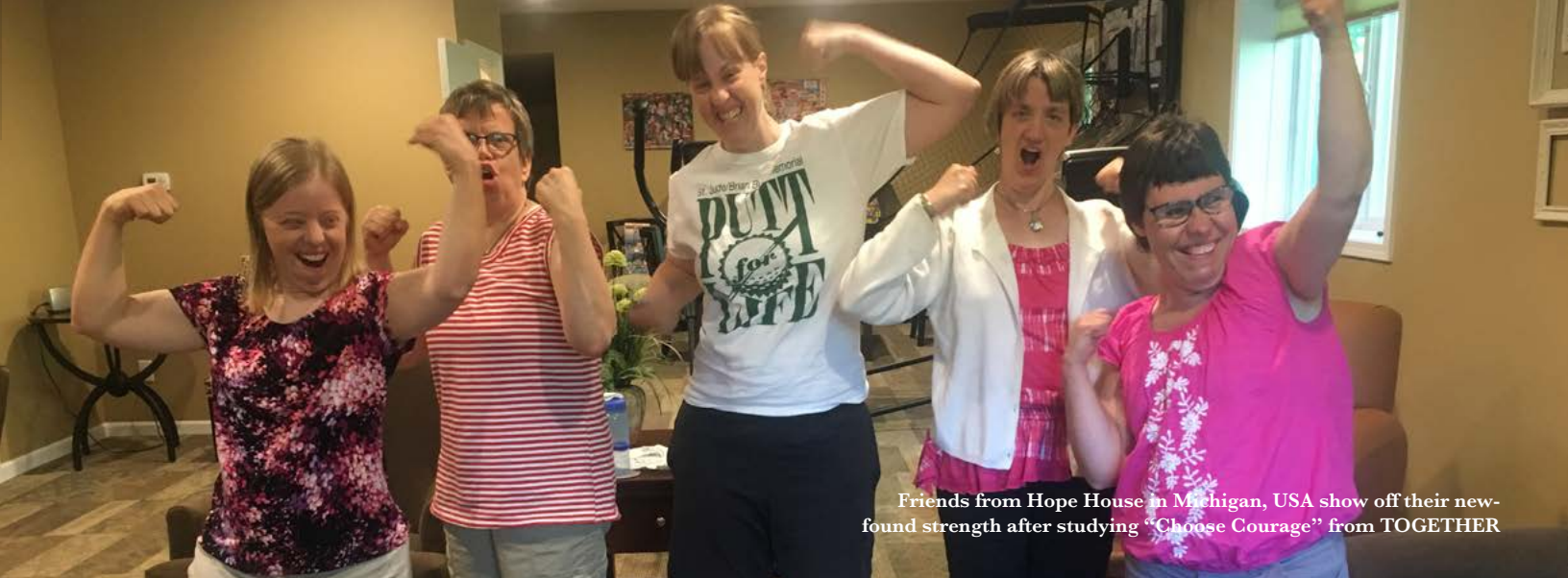
Friends from Hope House in Michigan, USA show off their new-found strength after studying "Choose Courage" from TOGETHER