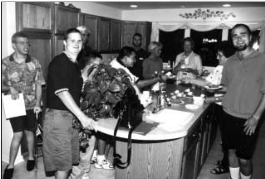
Residents and staff at Brother's House I enjoy Fellowship time.

(Taken from Breaking Barriers, a newsletter published Disability Concerns of the CRC Church)