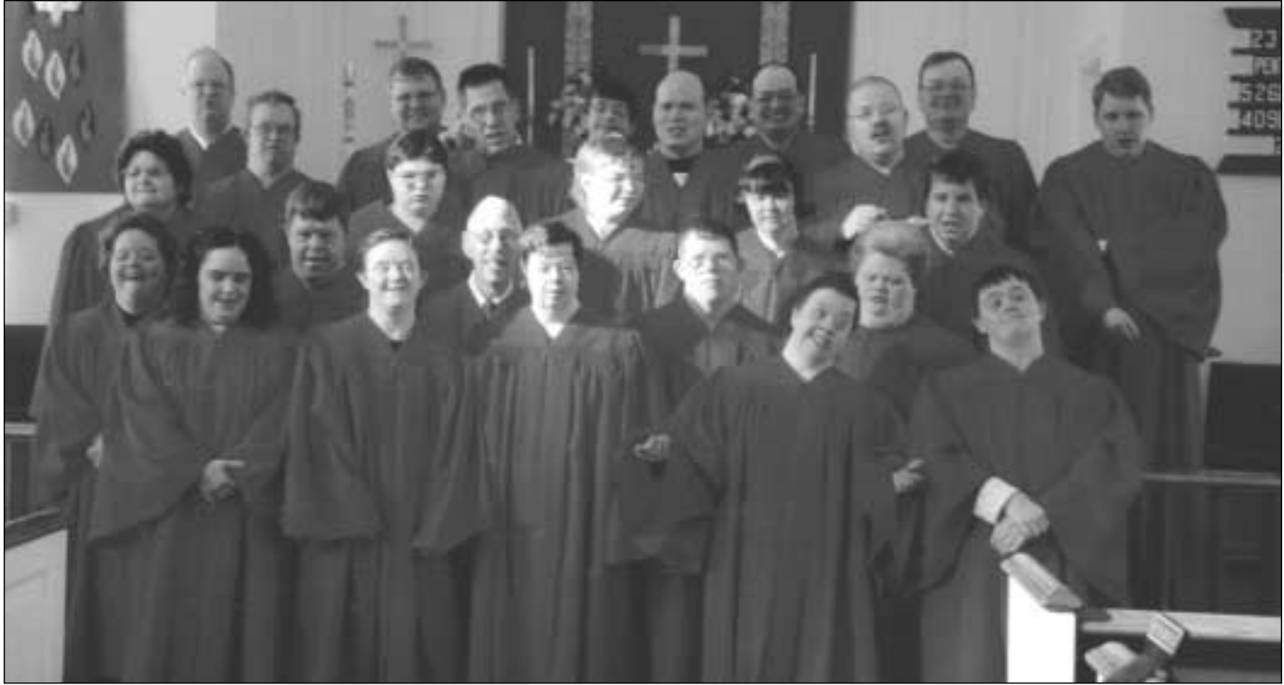
The choir proudly wears their new red robes!