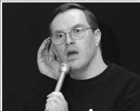
David sings a song about listening to God

Here are a few suggestions to help ensure meaningful Sunday worship. Share them with your pastors and worship planners!